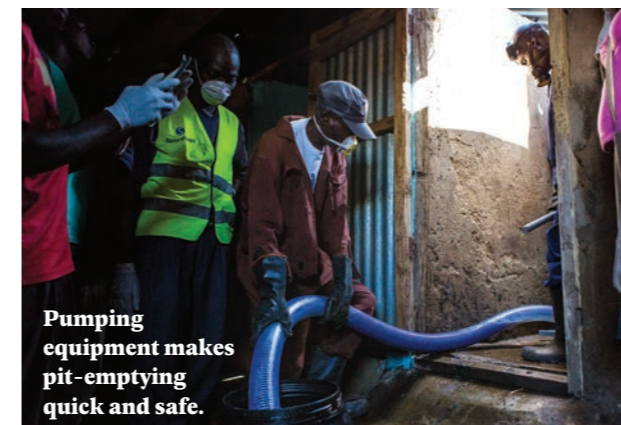
Pumping equipment makes pit-emptying quick and safe.

In urban slums, if there is any kind of waste management, it is usually done informally, by the poorest members of the community. Some empty pit latrines, some pick through rubbish to find anything that can be sold. We bring together these informal workers with local authorities so that their needs are heard and understood, and to build better, fairer systems.