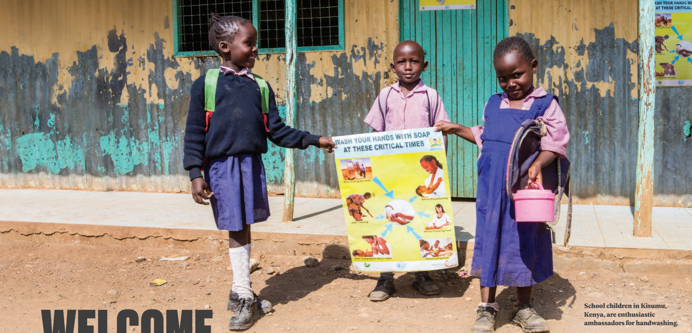
School children in Kisumu, Kenya, are enthusiastic ambassadors for handwashing.