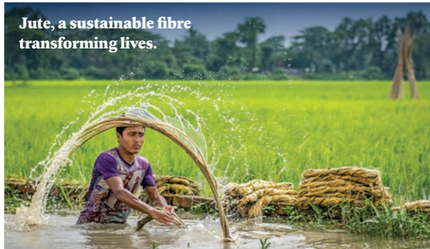
Jute, a sustainable fibre transforming lives.