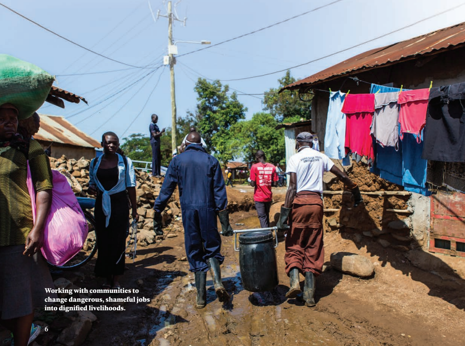
Working with communities to change dangerous, shameful jobs into dignified livelihoods.

Our work in cities focuses on sanitation and waste management. We're also beginning to explore ways of transforming waste into useful items. Let's look at each in turn, and highlight a few of the innovations we've already put in place.