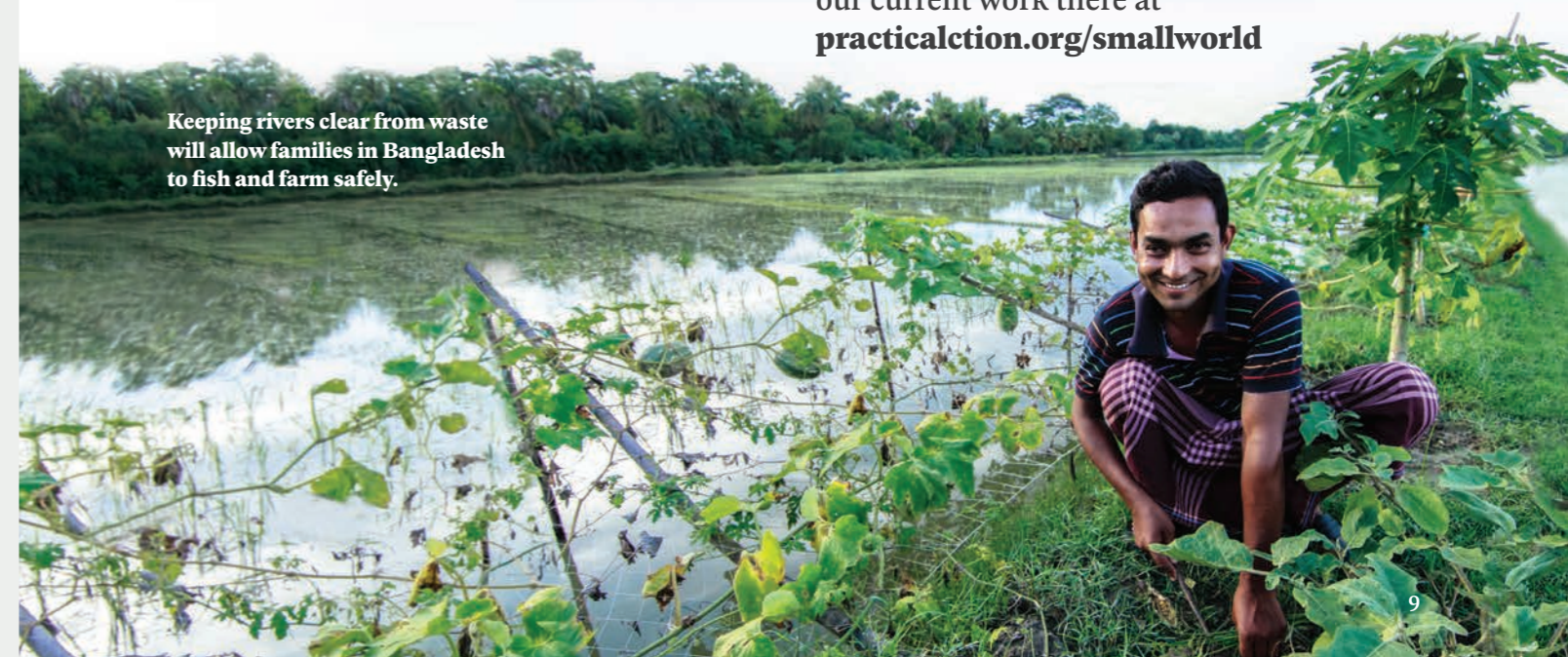
Keeping rivers clear from waste will allow families in Bangladesh to fish and farm safely.

Watch a recent video interview with our team in Bangladesh to learn more about our current work there at practicalaction.org/smallworld