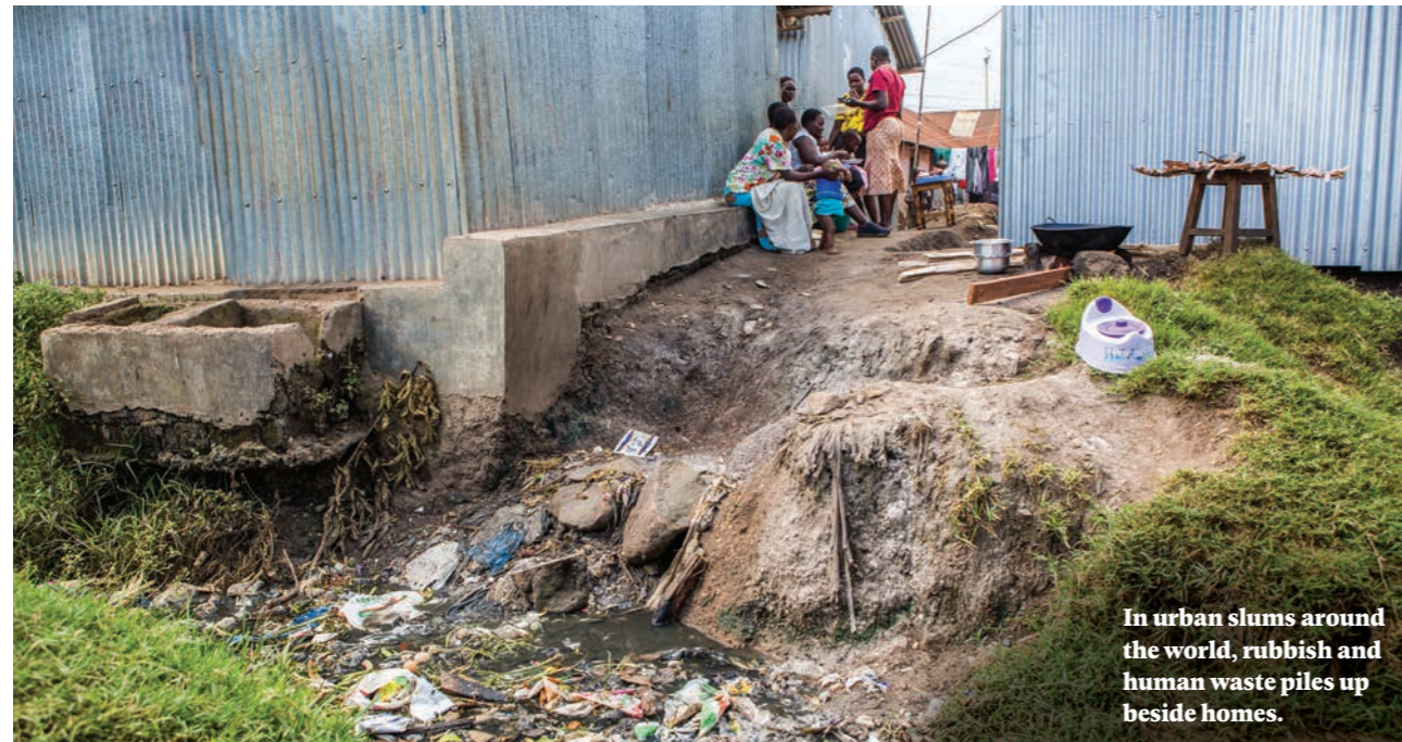
In urban slums around the world, rubbish and human waste piles up beside homes.