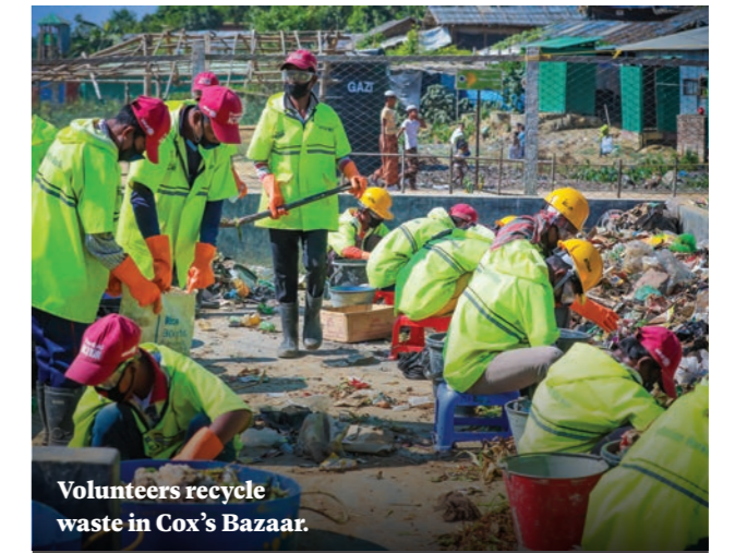
Volunteers recycle waste in Cox's Bazaar.

In Bangladesh, for example, we're in the early stages of a partnership with the Lamor Foundation and are discussing a potential project to collect plastic waste from rivers. Using an ingenious system the waste will be converted into fuel (see the interview on page 9).