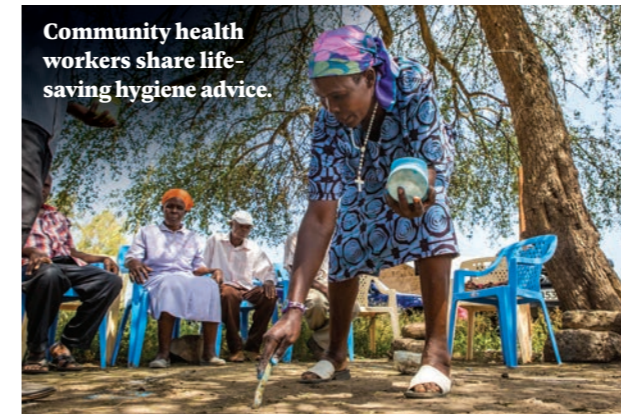
Community health workers share life-saving hygiene advice.