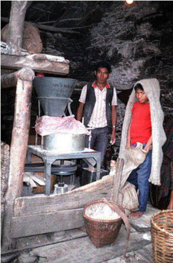
Figure 3: Micro hydro powered grain milling by villagers in Barpak, Nepal