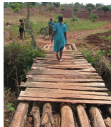
Accompanied Observation walks are one of the tools used